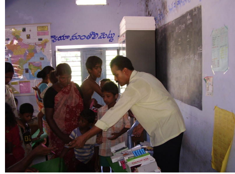
Free distribution of medicines